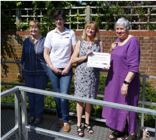
Front Cover. Grand opening of the new ramp – see also page 3